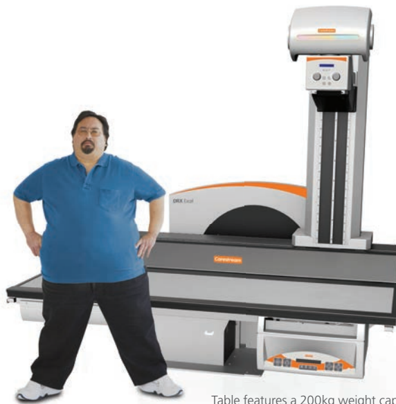
Table features a 200kg weight capacity to accommodate heavier patients.