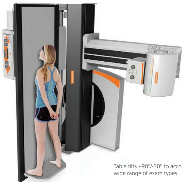
Table tilts +90°/-30° to accommodate a wide range of exam types.

Image-stitching station combines multiple images into one for easier reading of spine and lower-limb exams.