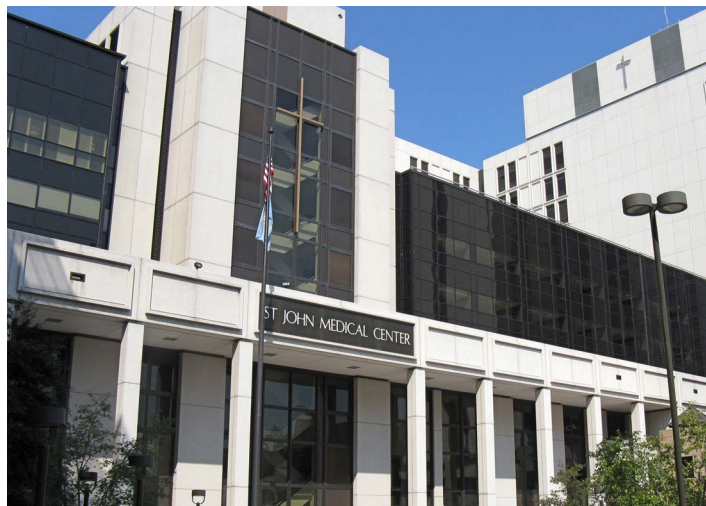
The 721-bed St. John Medical Center is the flagship of St. John Health System in Tulsa that also includes three smaller hospitals, 14 imaging centers and three urgent care centers. It produces 310,000 procedures a year and expects to see 1,500 patients a day by the end of 2009.

CAD markers for digital mammography studies are available with a single click. Additionally, integration with Confirma CADstream provides CAD for breast MRI studies from the same desktop. Productivity gains offered by the workstation were immediate and dramatic, according to Adams. "Carestream Health's workstation is extremely well-designed. It is easy to use but offers all the tools needed for reading of breast exams. After just 30 days, our radiologists were reporting a 20 percent increase in reading volumes."